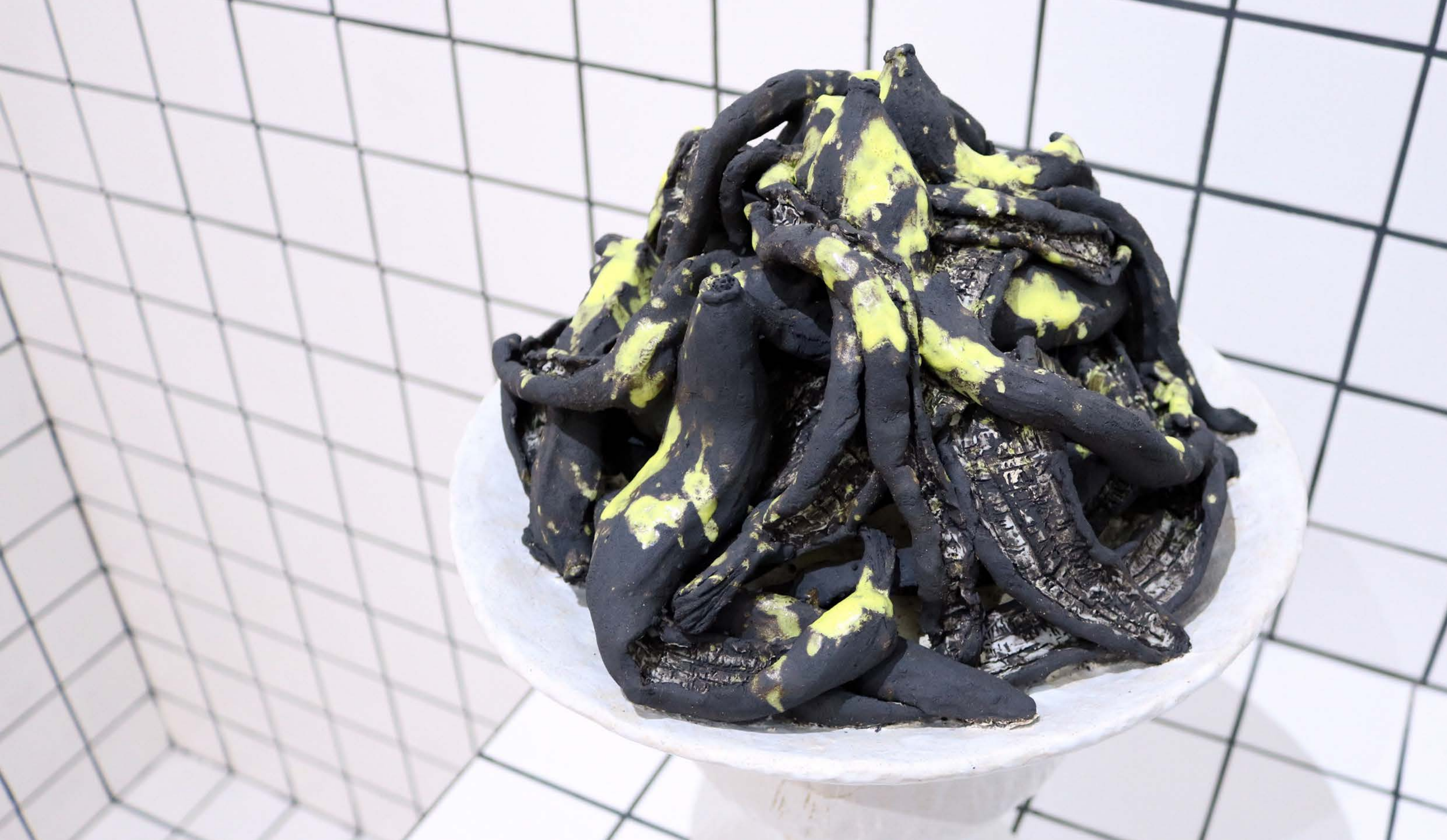
LAST OFFERING , 2018 Stoneware, black stoneware, underglaze, glaze 50 x 32 x 32 cm