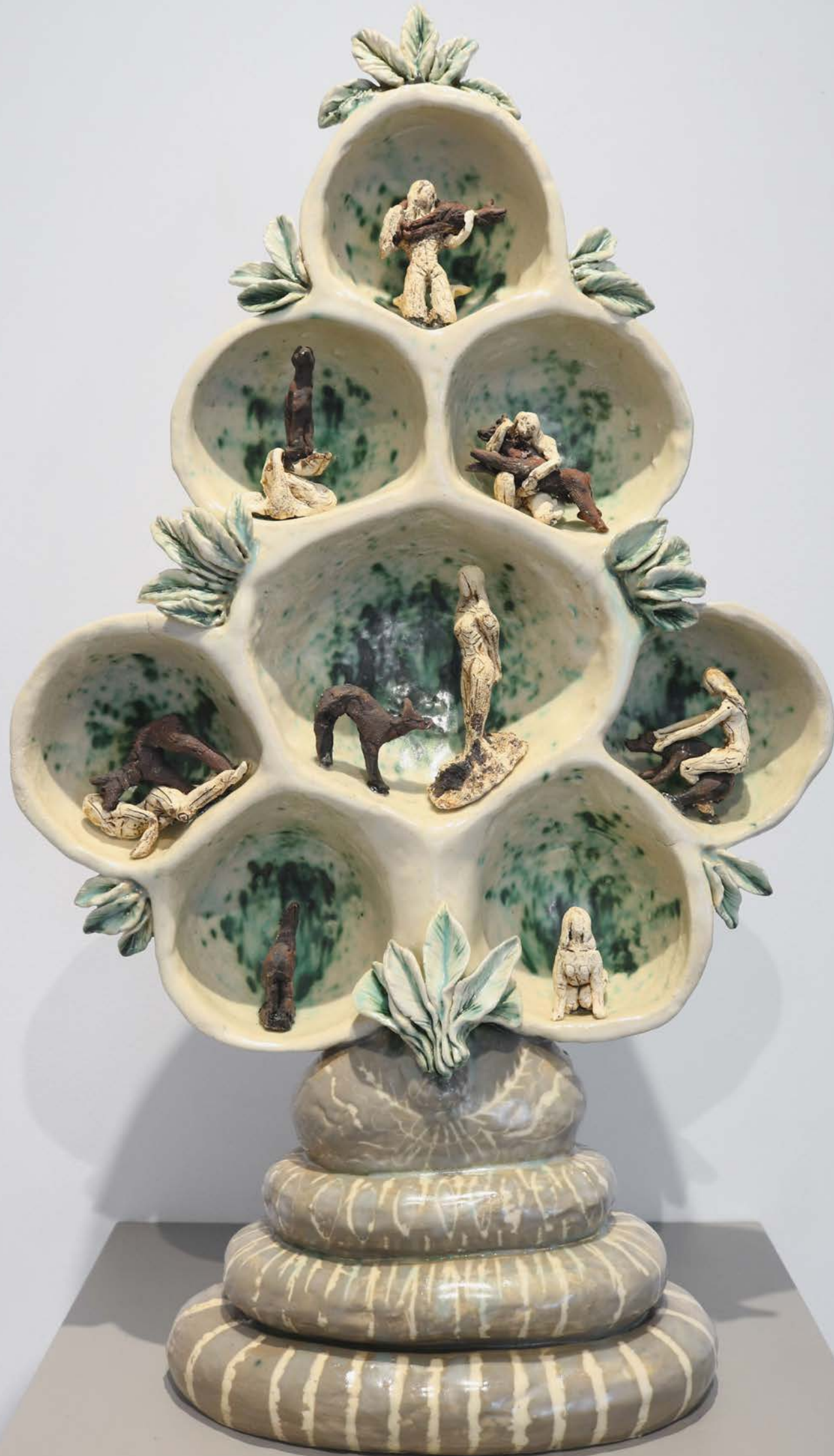
TREE OF LIFE , 2018 Stoneware, red stoneware, oxides, underglaze, glaze 65 x 40 x 15 cm