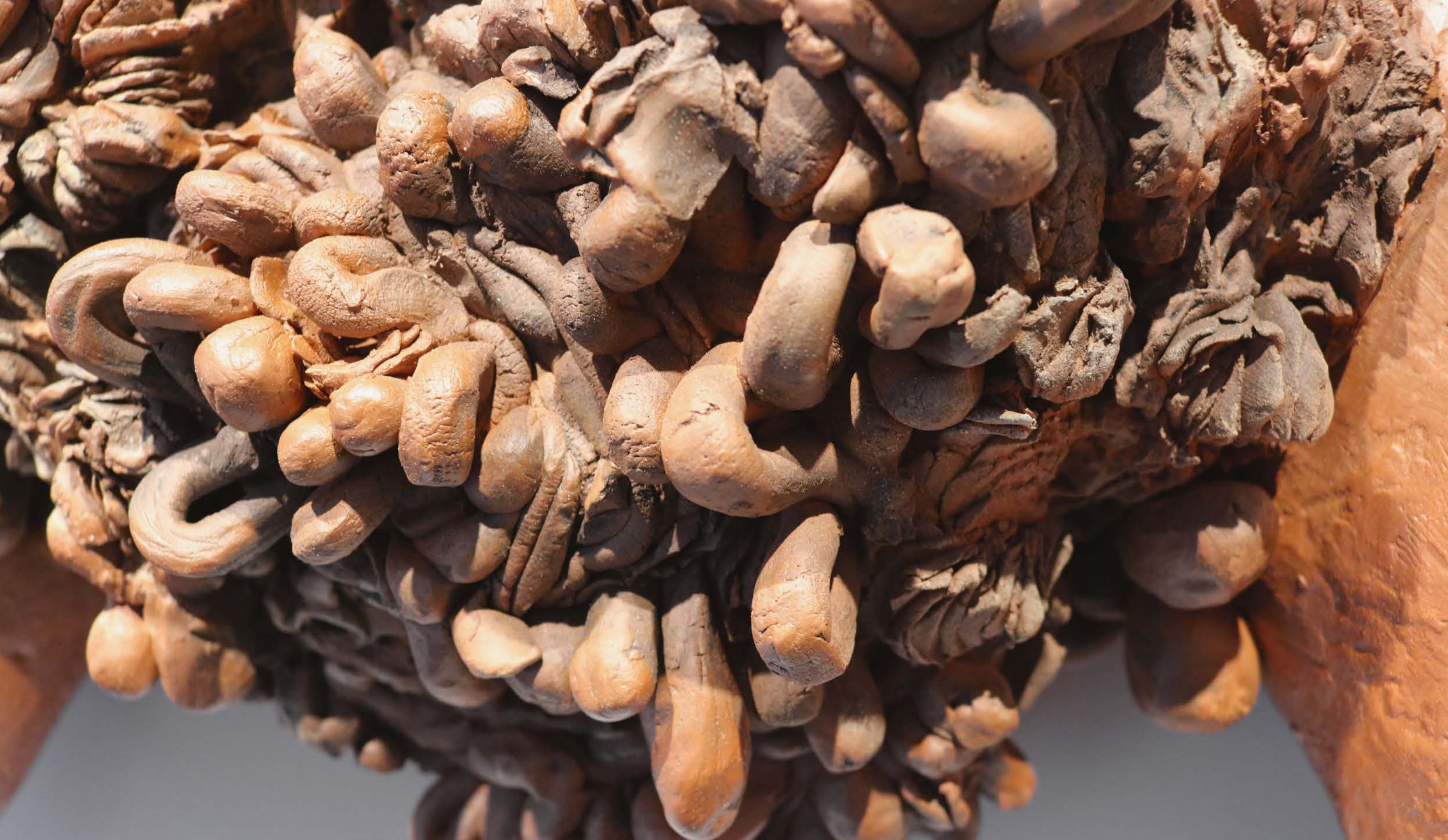
CEREBRAL , 2018 Clay, stains, terra sigillata 50 x 25 x 25 cm