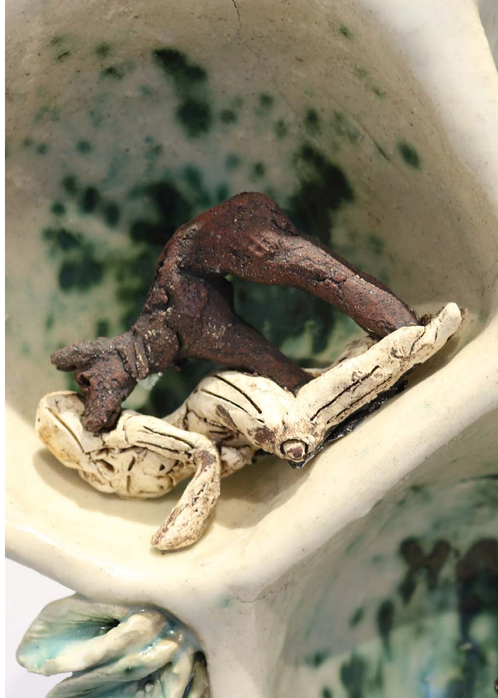
TREE OF LIFE , 2018 Stoneware, red stoneware, oxides, underglaze, glaze 65 x 40 x 15 cm