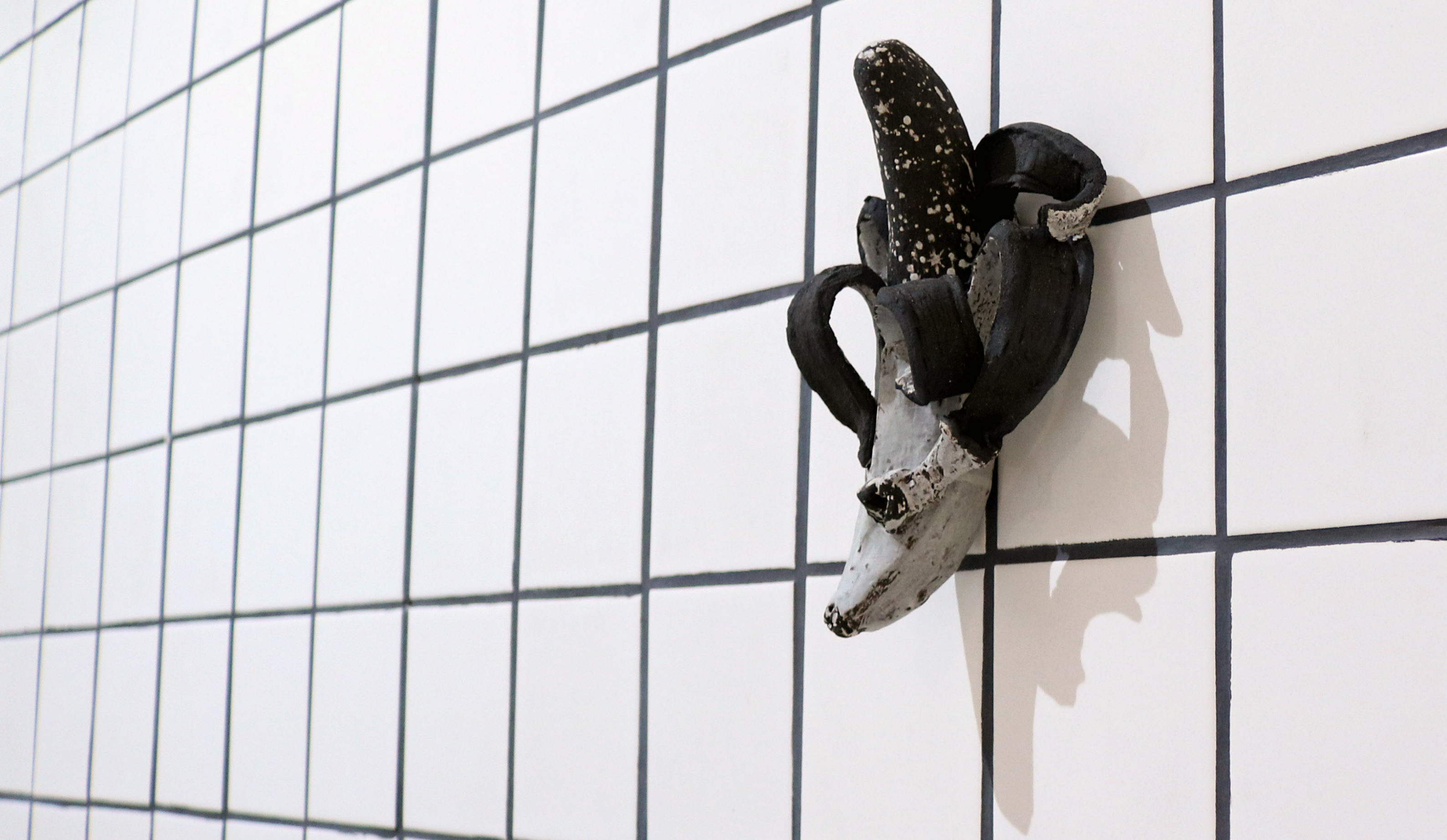
HORROR VACUI , 2018 Black stoneware, underglaze 19 x 13 x 06 cm