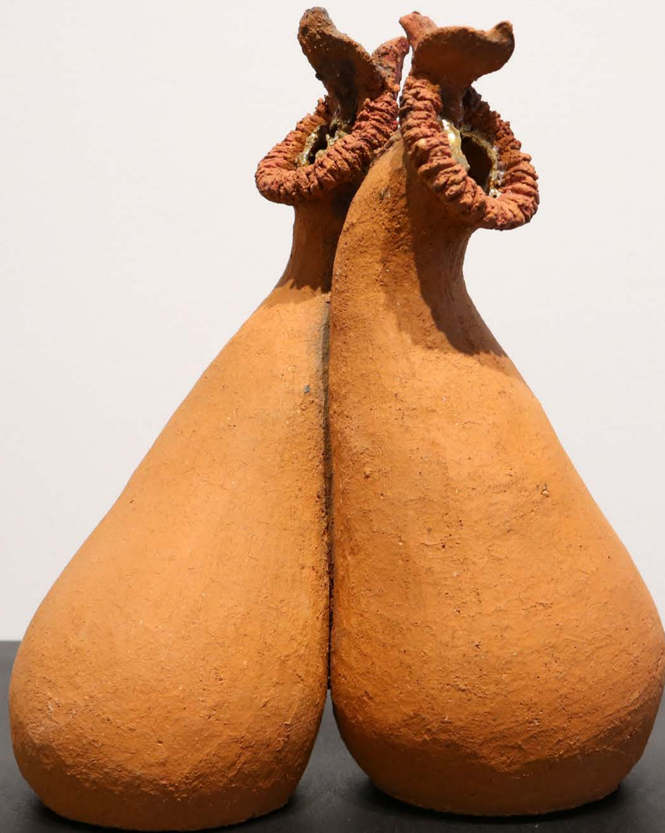
CARNIVORE , 2017 Clay, stains, golden luster 23 x 19 x 12 cm