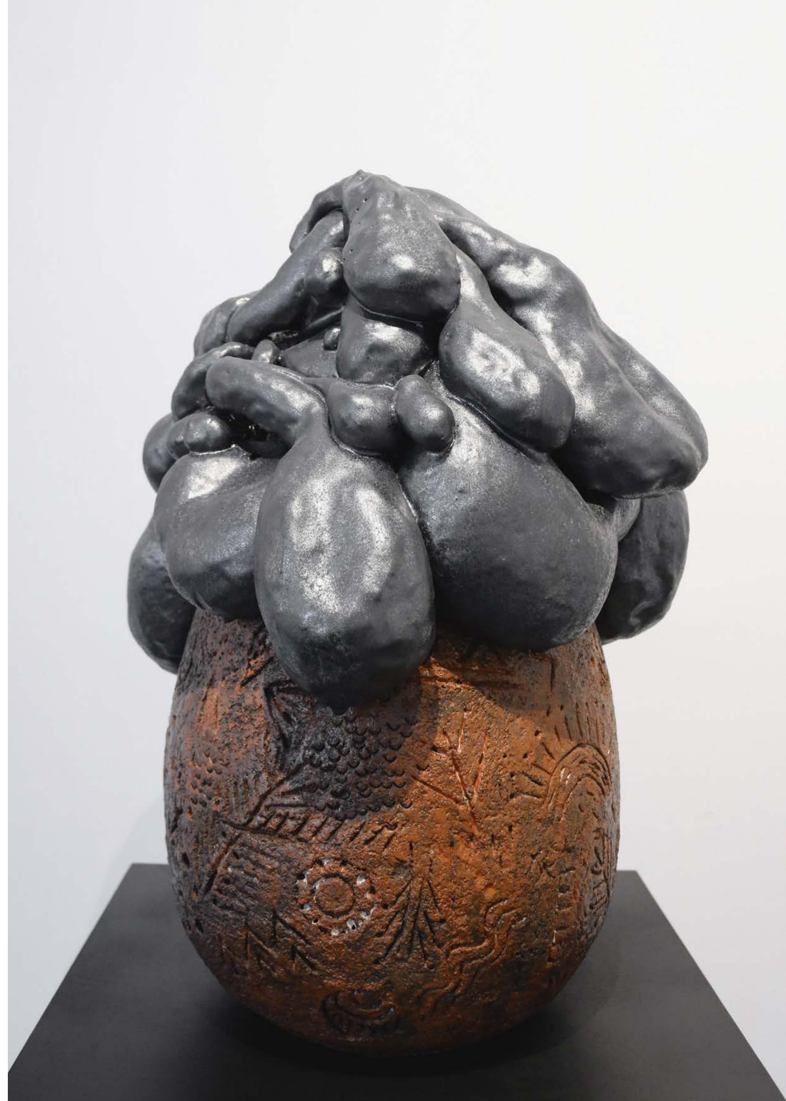
ERUPTION , 2018 Stoneware, red stoneware, oxides, terra sigillata, glaze. 51 x 40 x 42 cm