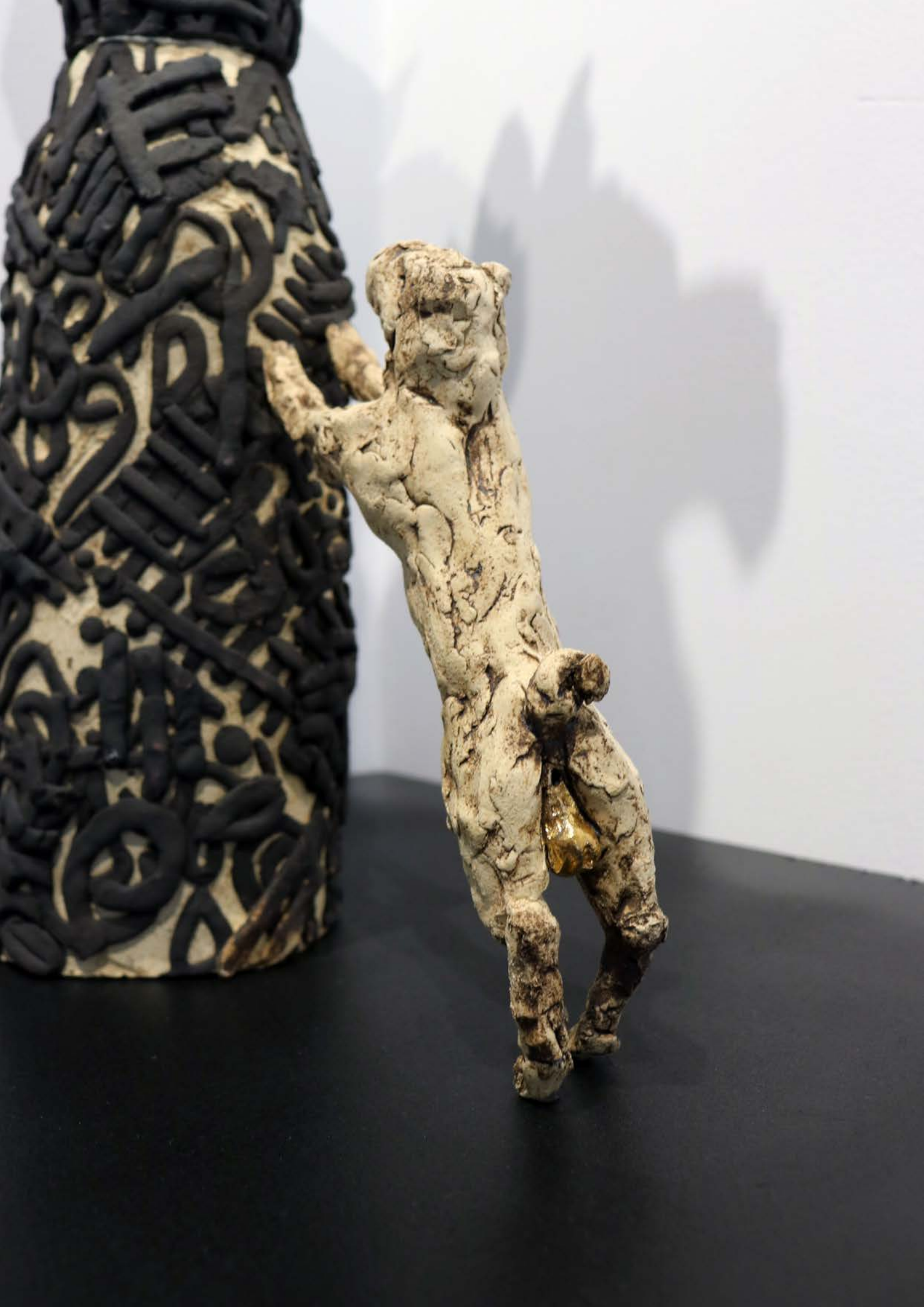
UNTIL THE END OF LOVE , 2017 Stoneware, black stoneware, underglaze, oxides, golden luster 46 x 20 x 17 cm