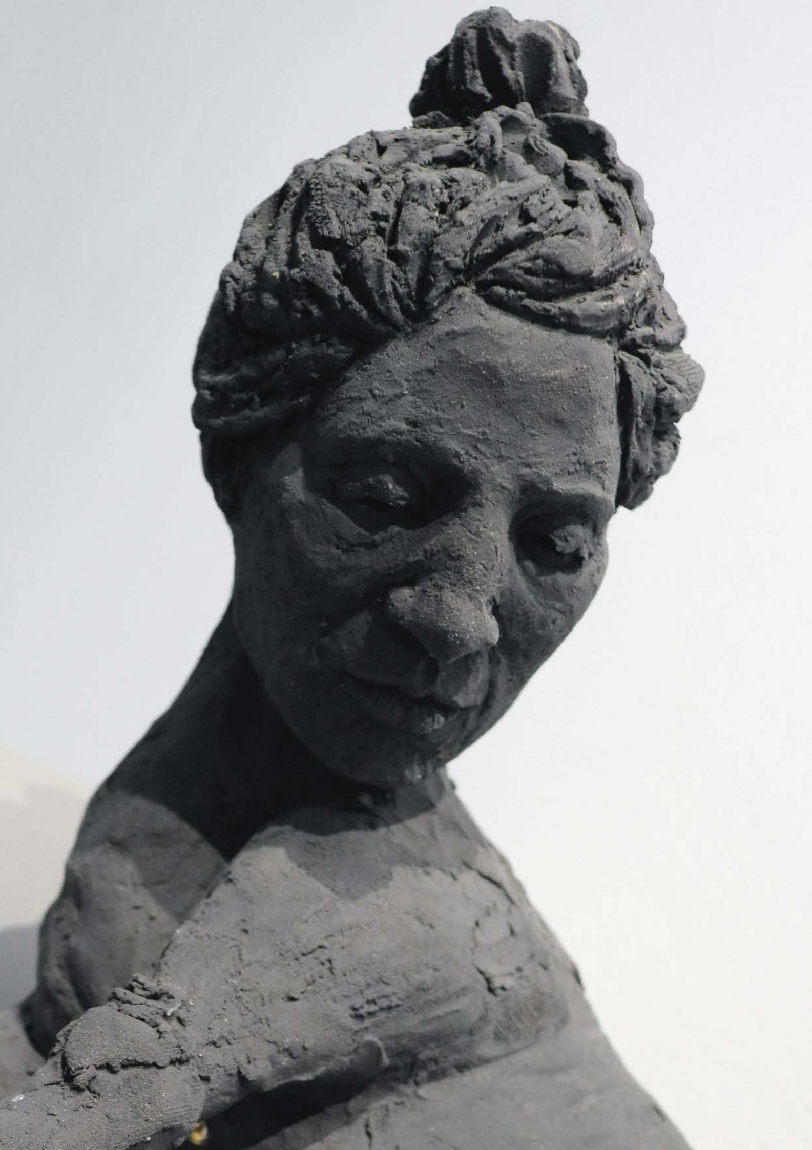
DOGWOMAN , 2017 Black stoneware, glaze, gold luster 32 x 23 x 25 cm