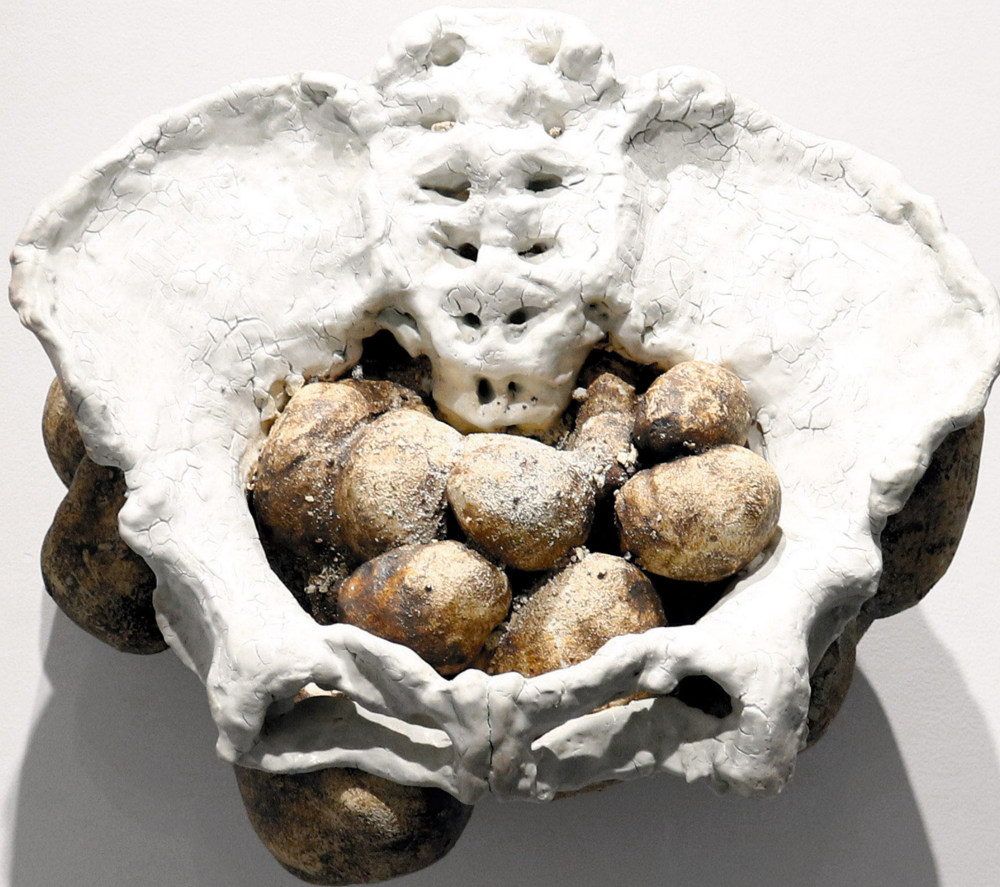
GENESIS , 2018 Stoneware, porcelain, terra sigillata, underglaze, oxides, glaze 178 x 58 x 30 cm