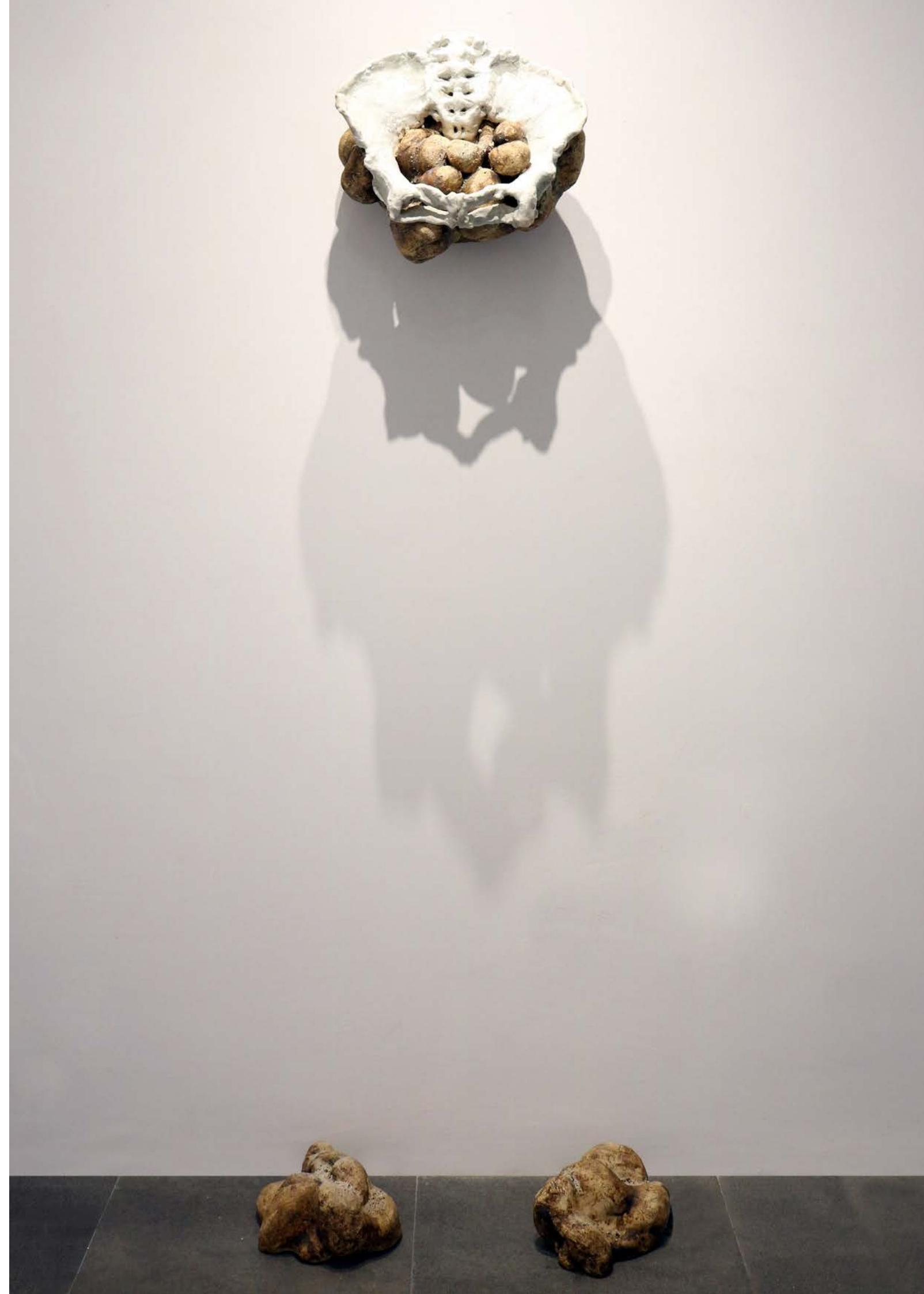
GENESIS , 2018 Stoneware, porcelain, terra sigillata, underglaze, oxides, glaze 178 x 58 x 30 cm