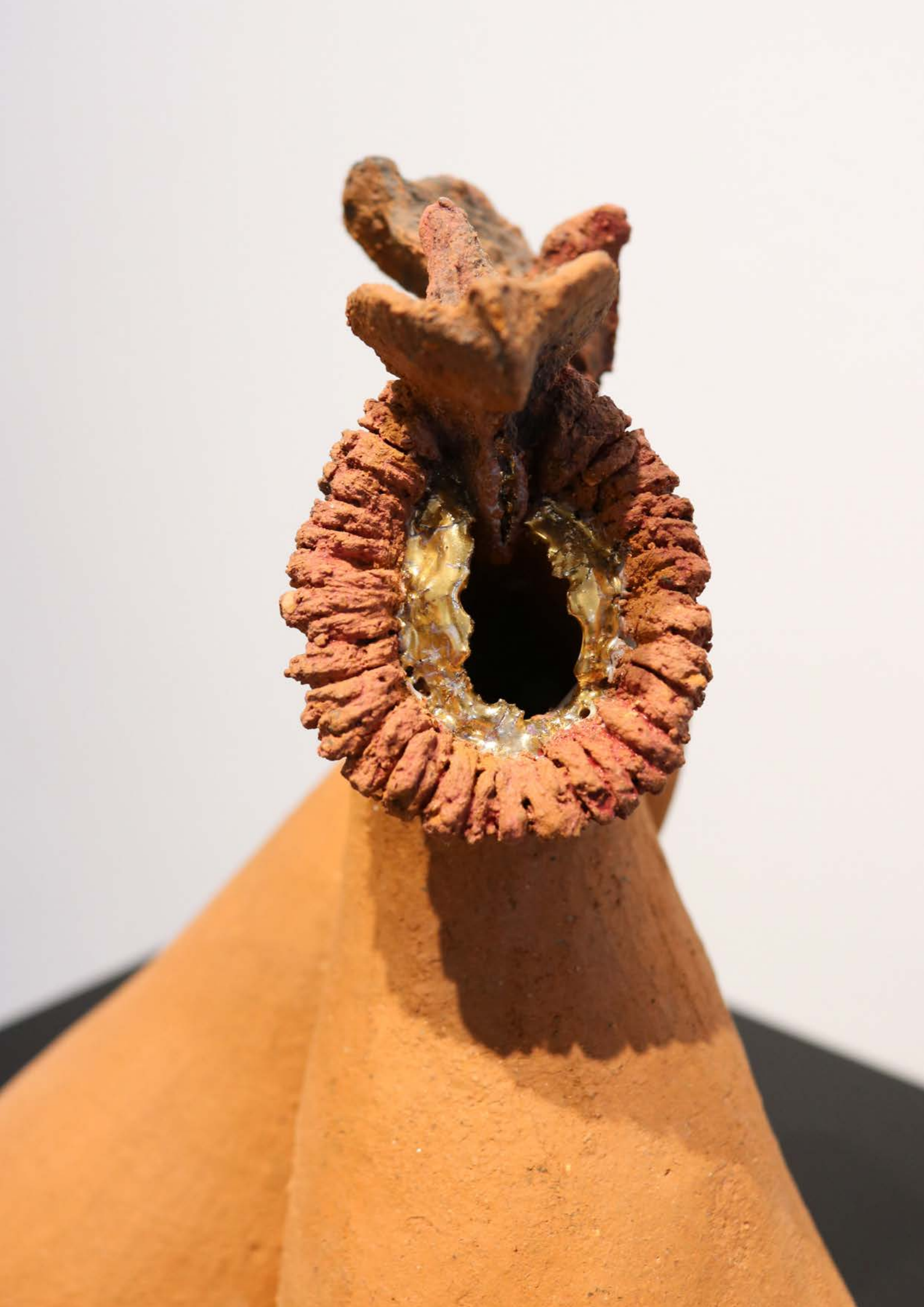
CARNIVORE , 2017 Clay, stains, golden luster 23 x 19 x 12 cm