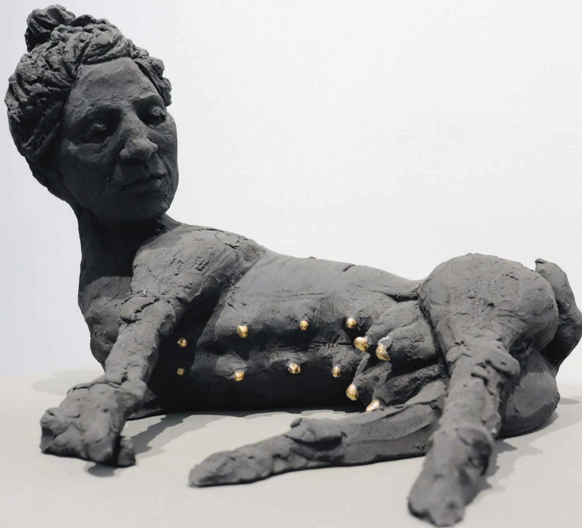
DOGWOMAN , 2017 Black stoneware, glaze, gold luster 32 x 23 x 25 cm