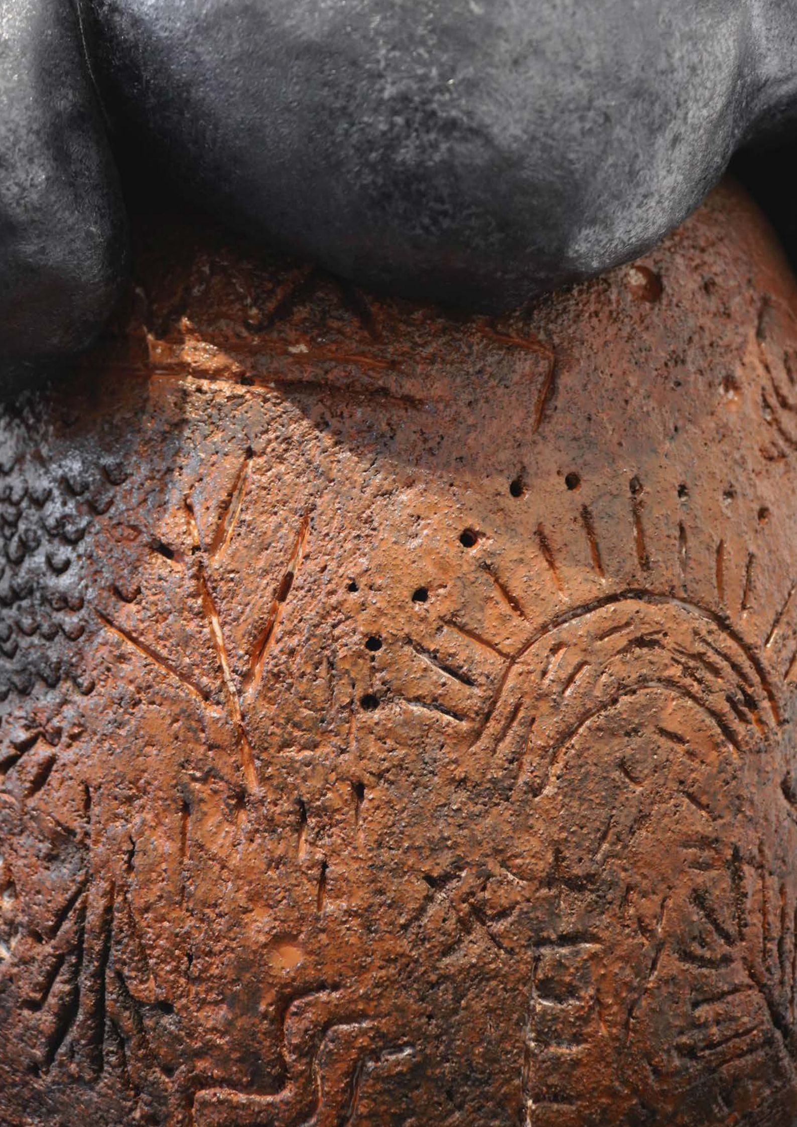
ERUPTION , 2018 Stoneware, red stoneware, oxides, terra sigillata, glaze 51 x 40 x 42 cm