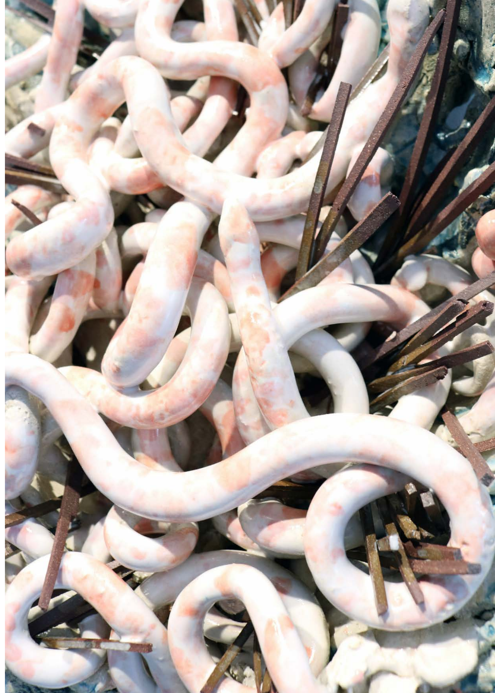
PARADISE LOST , 2018 Stoneware, red stoneware, porcelain, oxides, glaze 49 x 41 x 12 cm