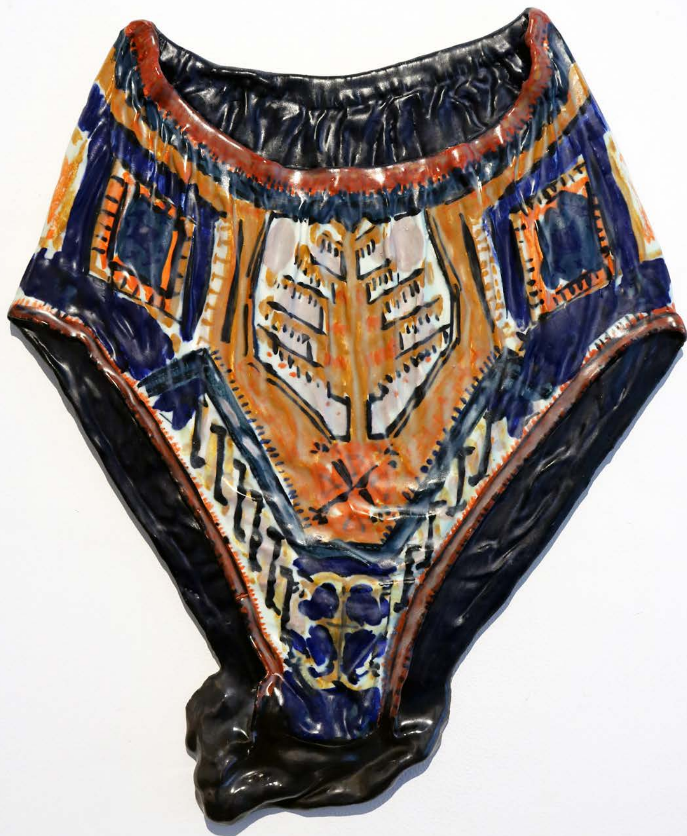
OBJECT OF COMFORT FOR HUMAN HOUSES , 2018 Earthenware, underglaze, glaze 45 x 36 x 02 cm