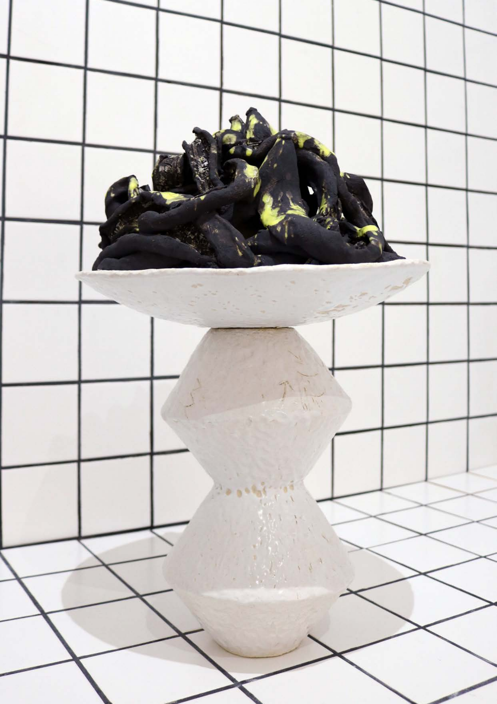
LAST OFFERING , 2018 Stoneware, black stoneware, underglaze, glaze 50 x 32 x 32 cm