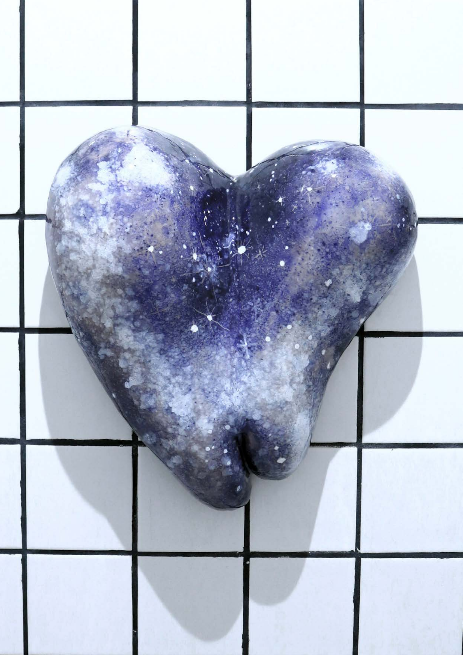
BIG BANG , 2017 Clay, stains, glaze 33 x 32 x 12 cm