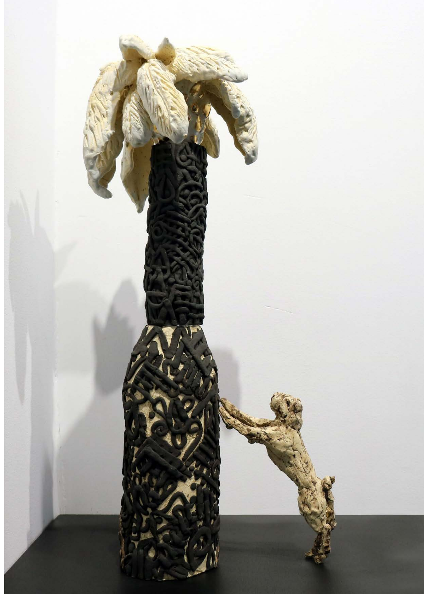
UNTIL THE END OF LOVE , 2017 Stoneware, black stoneware, underglaze, oxides, golden luster 46 x 20 x 17 cm