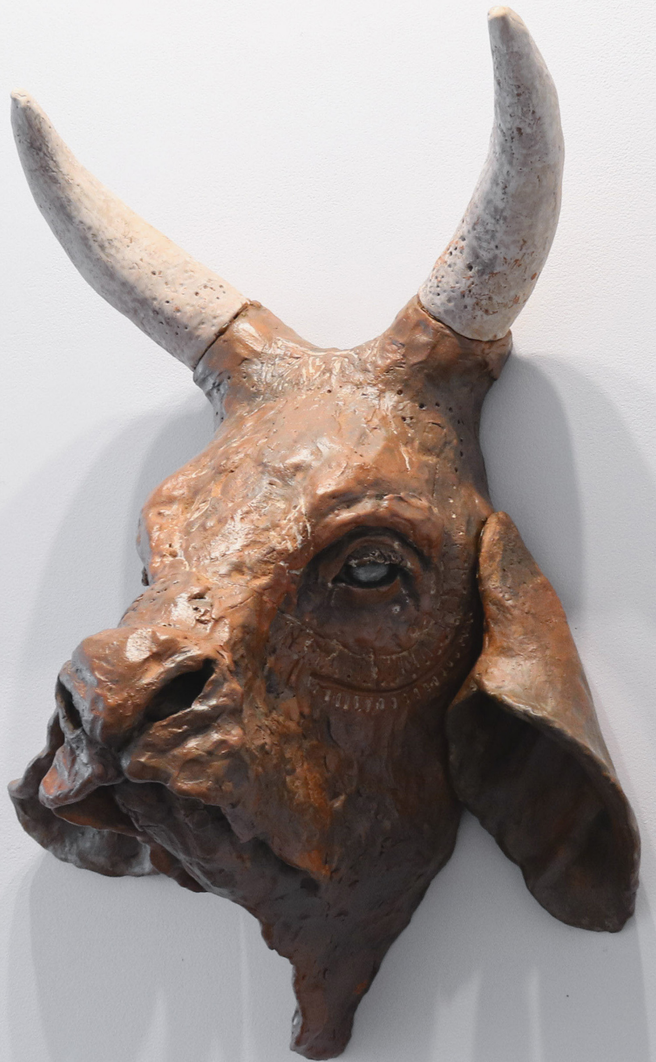
MOTHER , 2018 Black stoneware, glaze, gold luster 57 x 40 x 29 cm