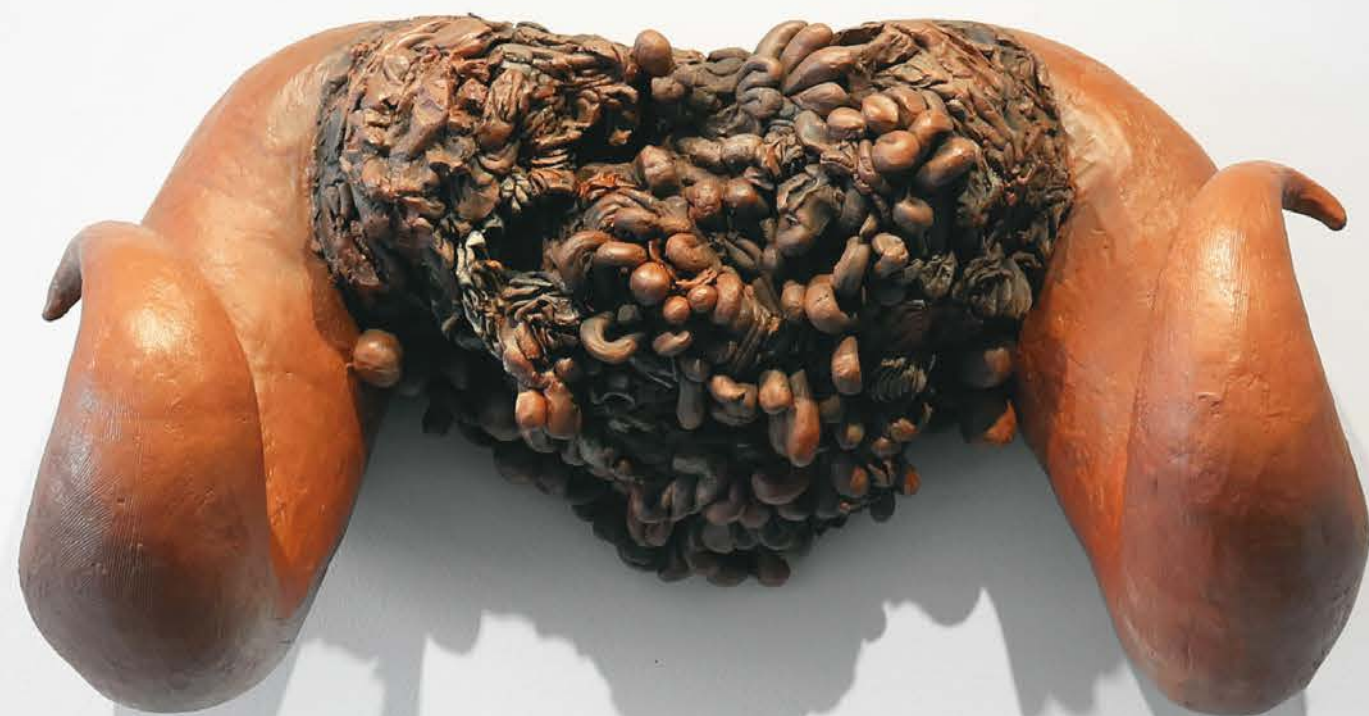
CEREBRAL , 2018 Clay, stains, terra sigillata 50 x 25 x 25 cm