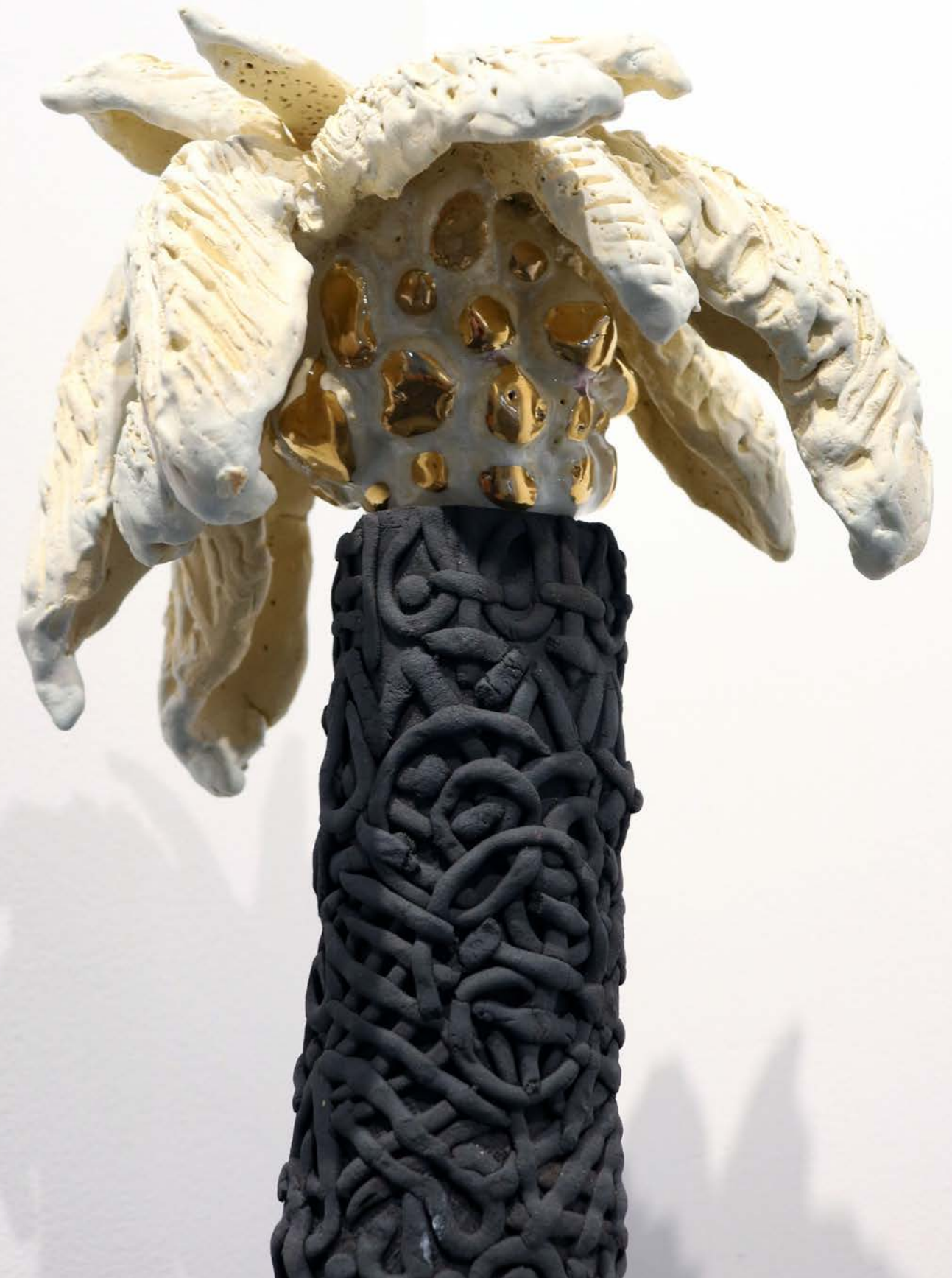
UNTIL THE END OF LOVE , 2017 Stoneware, black stoneware, underglaze, oxides, golden luster 46 x 20 x 17 cm