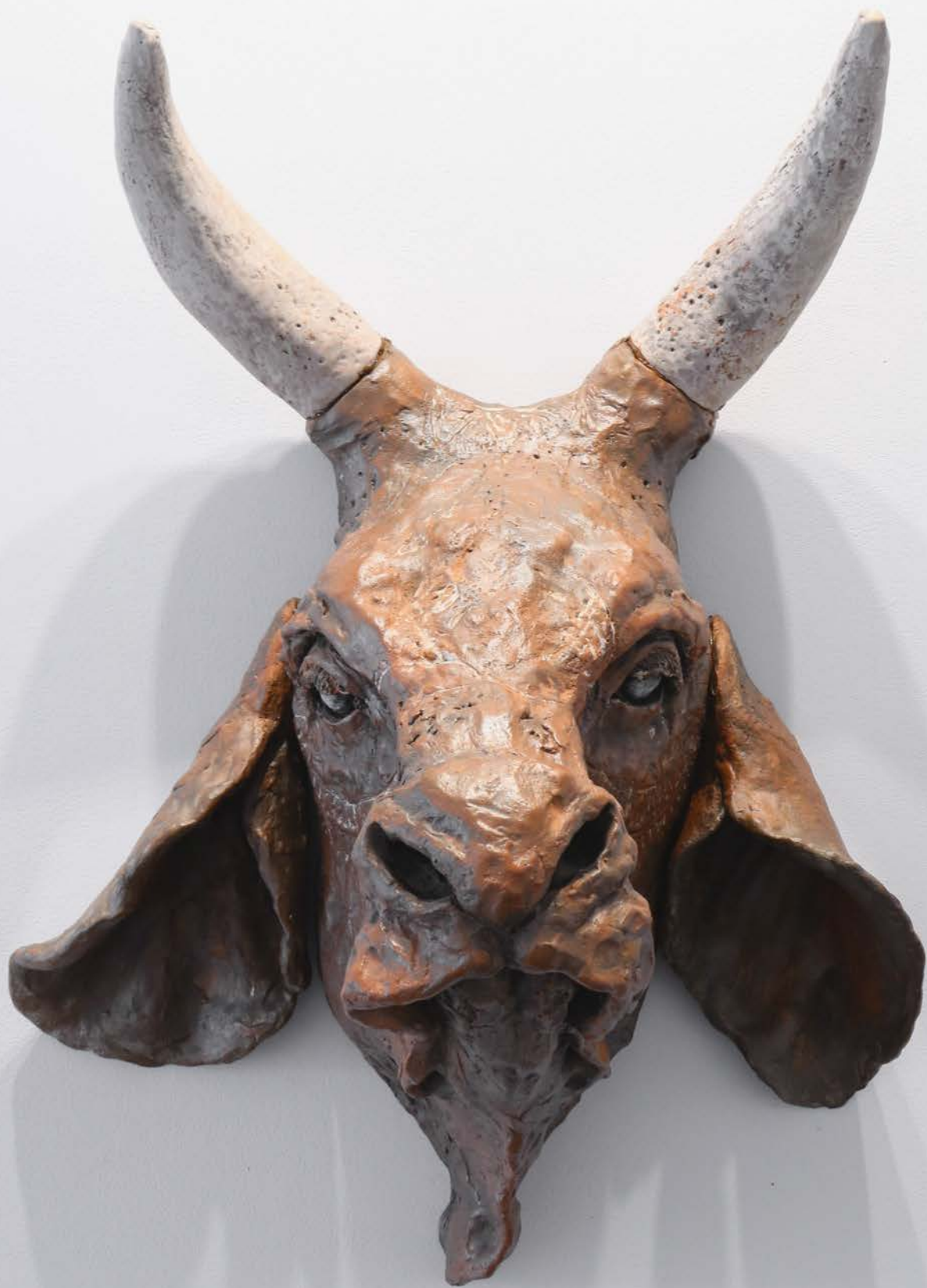
MOTHER , 2018 Black stoneware, glaze, gold luster 57 x 40 x 29 cm