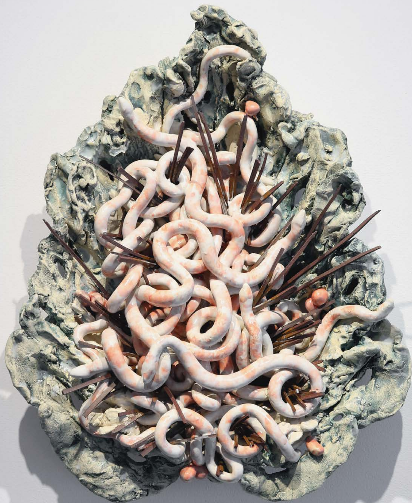
PARADISE LOST , 2018 Stoneware, red stoneware, porcelain, oxides, glaze 49 x 41 x 12 cm