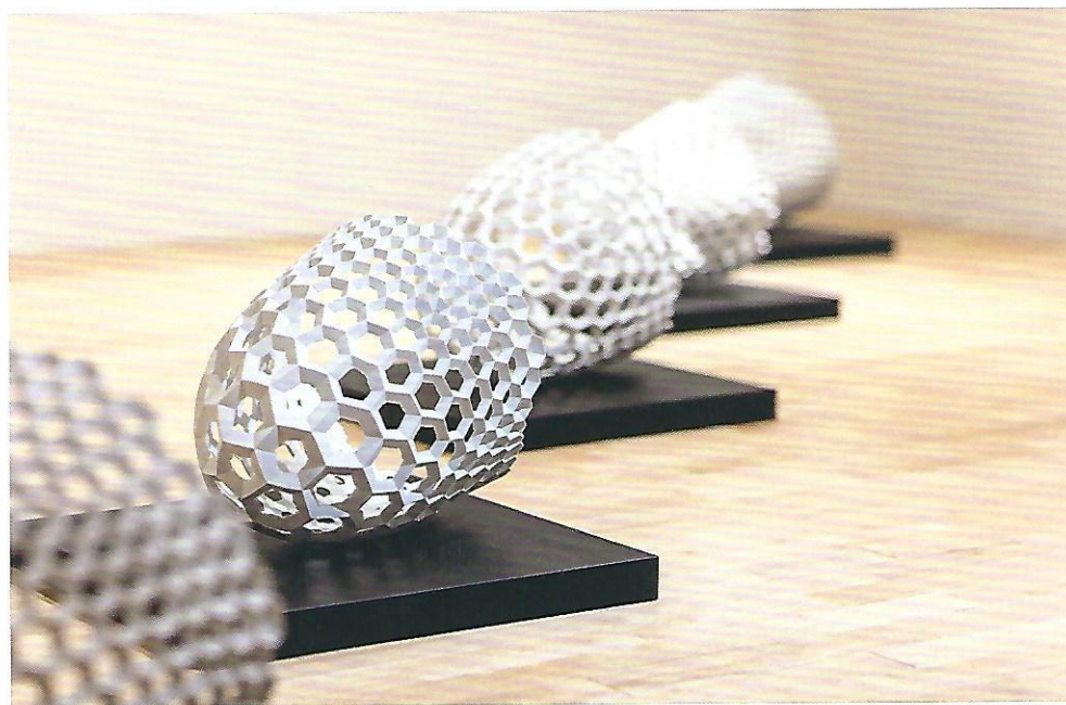
객체 2018, 자기점토 Individual 2018, Porcelain 42 × 42 × 45