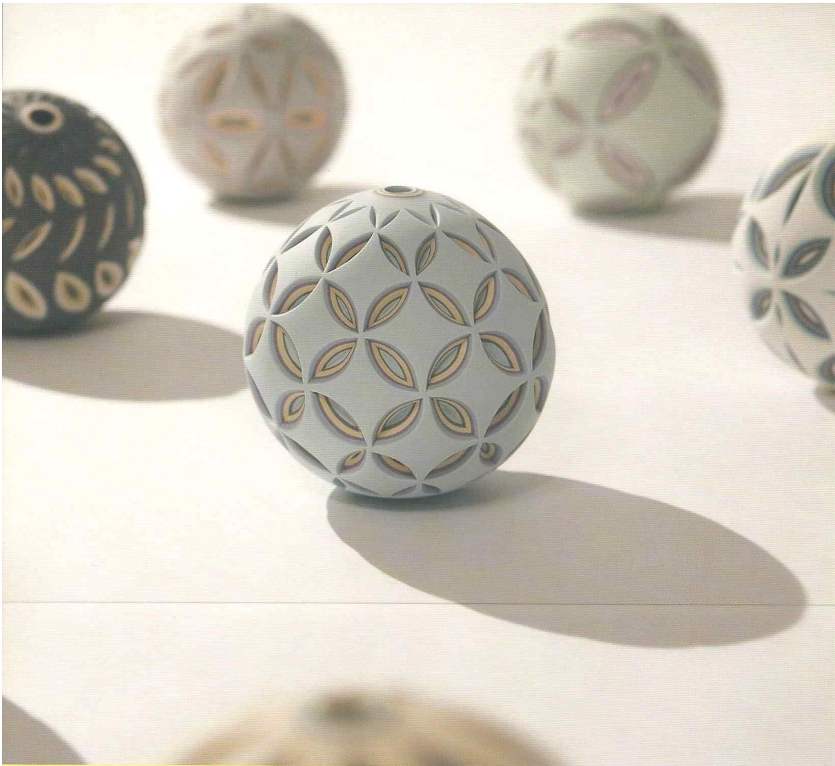
from circle | 12×12×12cm(each) | porcelain, colored clay | 1250℃