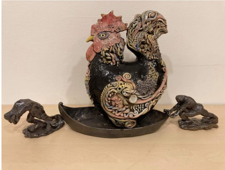
THE ROOSTER, 2020, 30x80 cm, Stoneware and earthenware