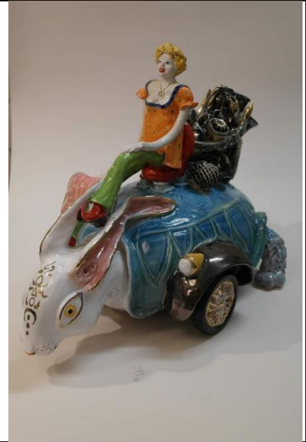
CITY LEGEND 2019 65x50x40 cm Gold and glaze