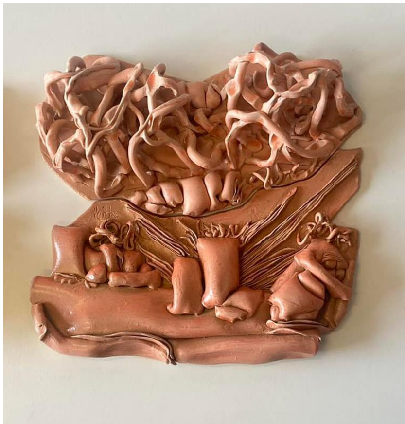
OUT OF SHAPE, Stoneware 120x40 cm.