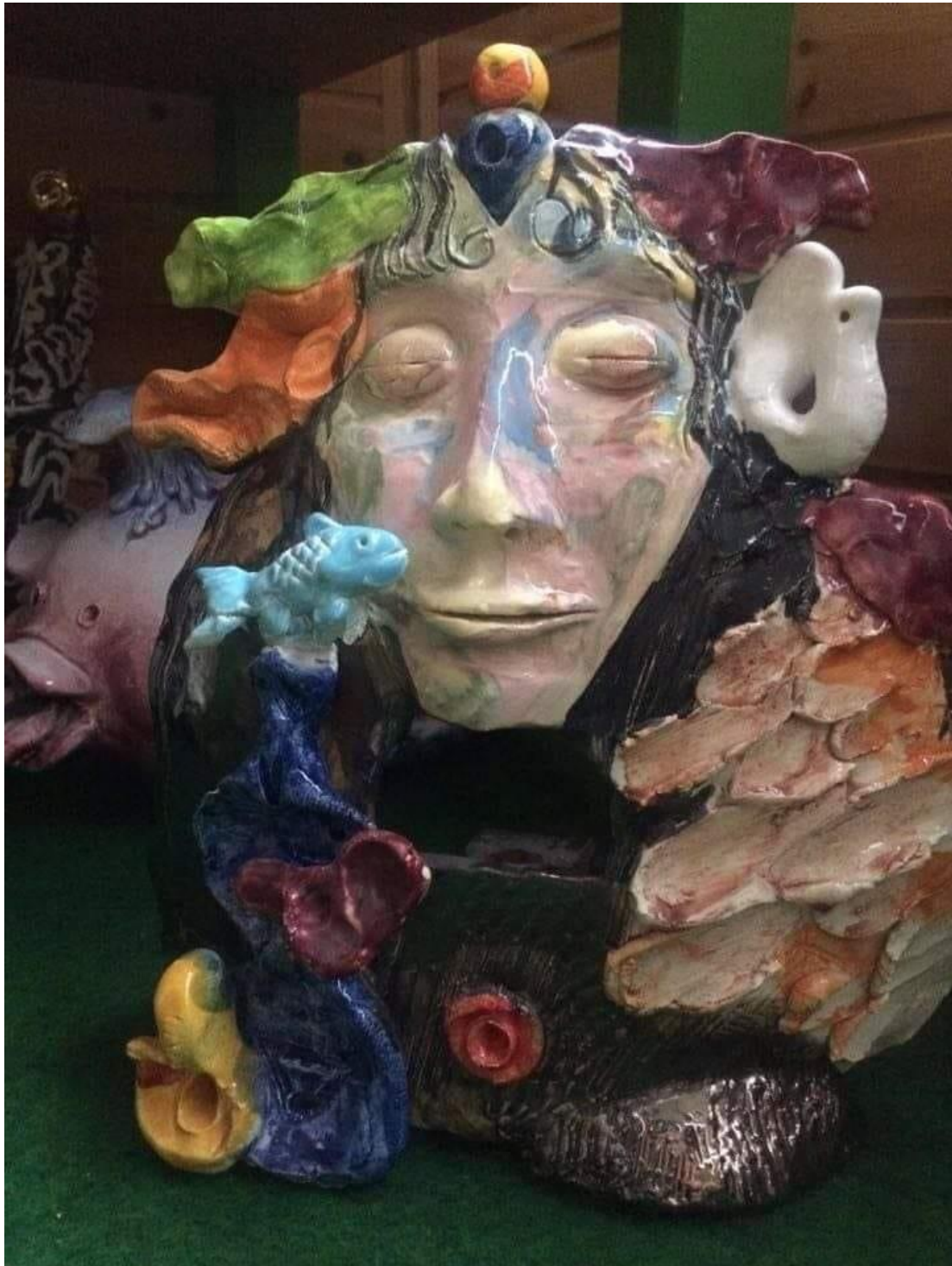
Ceramic Dream, 2018, 40x35 cm, Earthenware