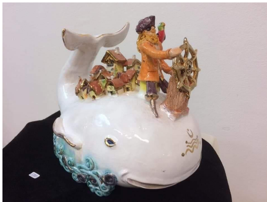
TALE WORLD 2016 50x40 cm Earthenware