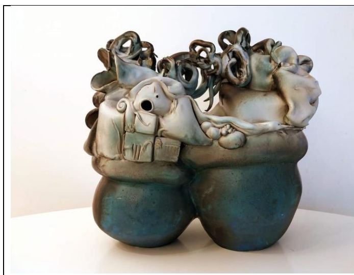
Contact with 20 th , Stoneware 1250C, 45x45cm Dimension