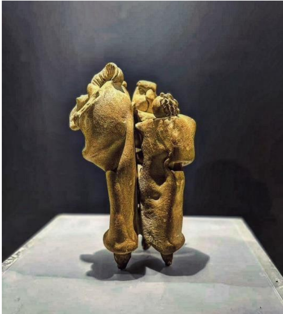
PEOPLE FROM, Kuwait, 2023, 50x35x20 cm.