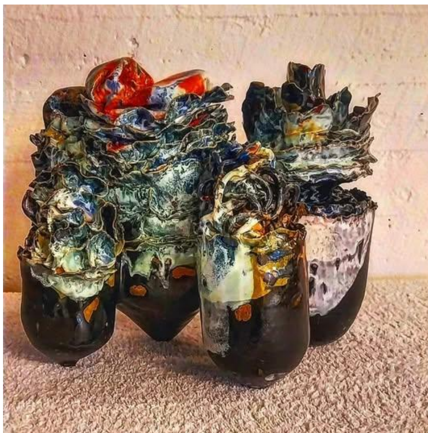
NATURE, 2024. Stoneware 1250c 45×45cm.