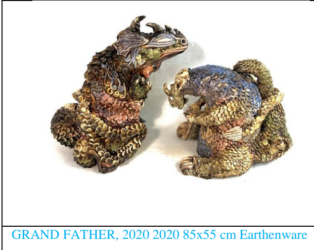
GRAND FATHER, 2020 2020 85x55 cm Earthenware