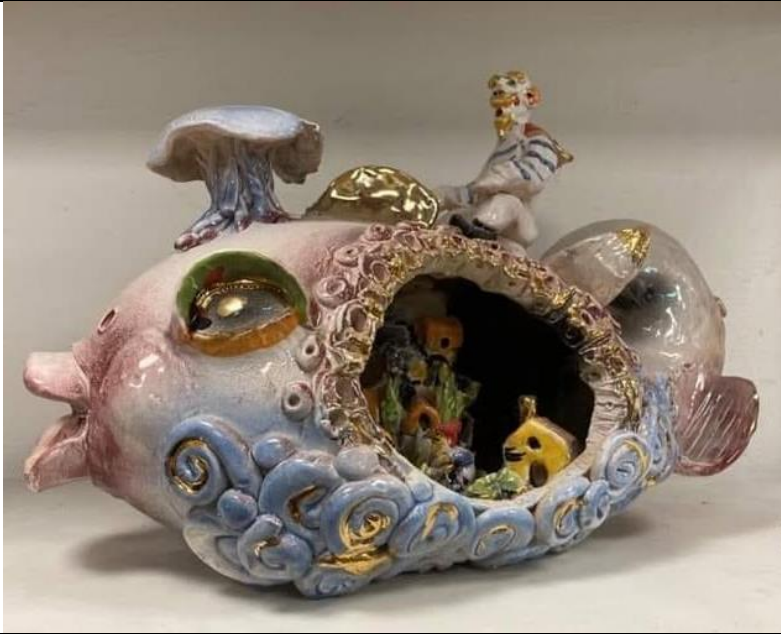
2019 45x35 cm Earthenware