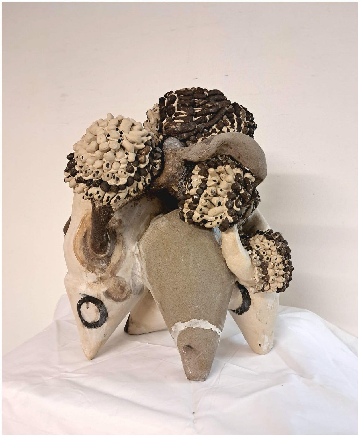
Stoneware 1240c 45x45cm postmodern 2024