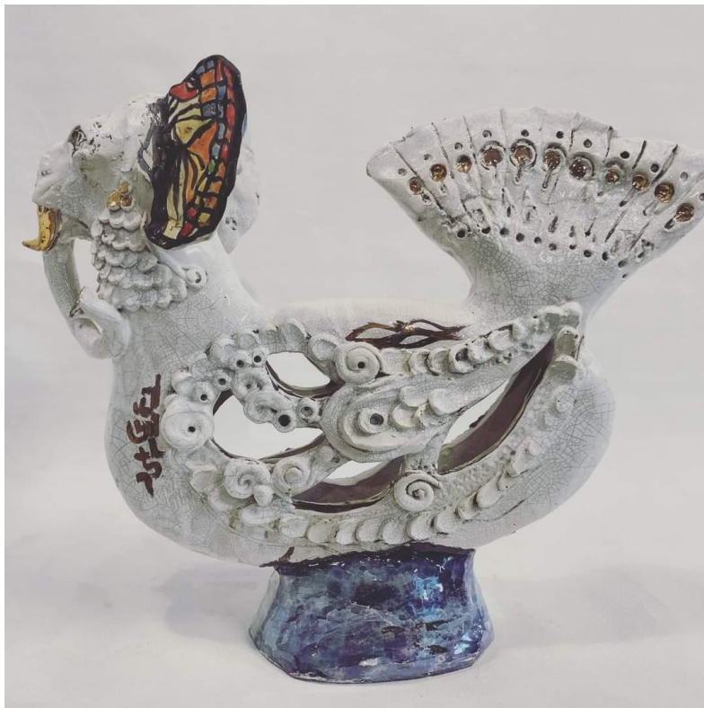
A BIRD FROM THE COUNTRY OF THE BUTTERFLY, 2017, 50x40 cm, Earthenware