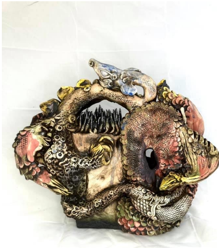
Forgotten Legend, 2021, 35x35x15cm, Earthenware