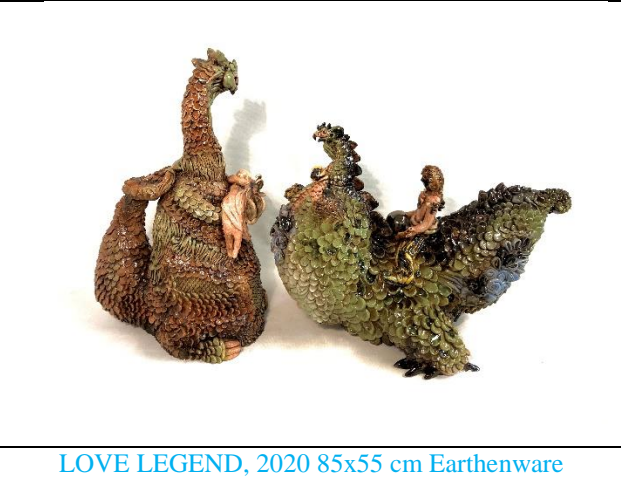
LOVE LEGEND, 2020 85x55 cm Earthenware