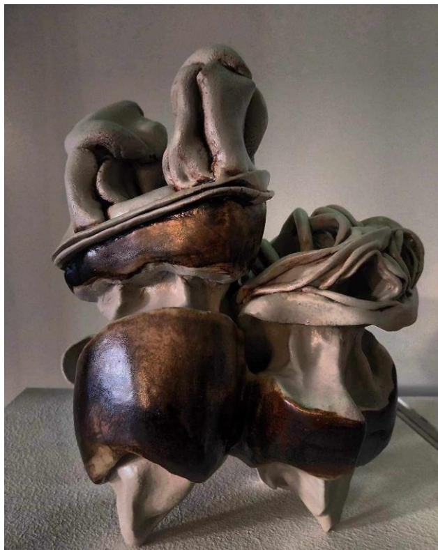
THE NOTHING, 2023. Stoneware, 30x25 cm