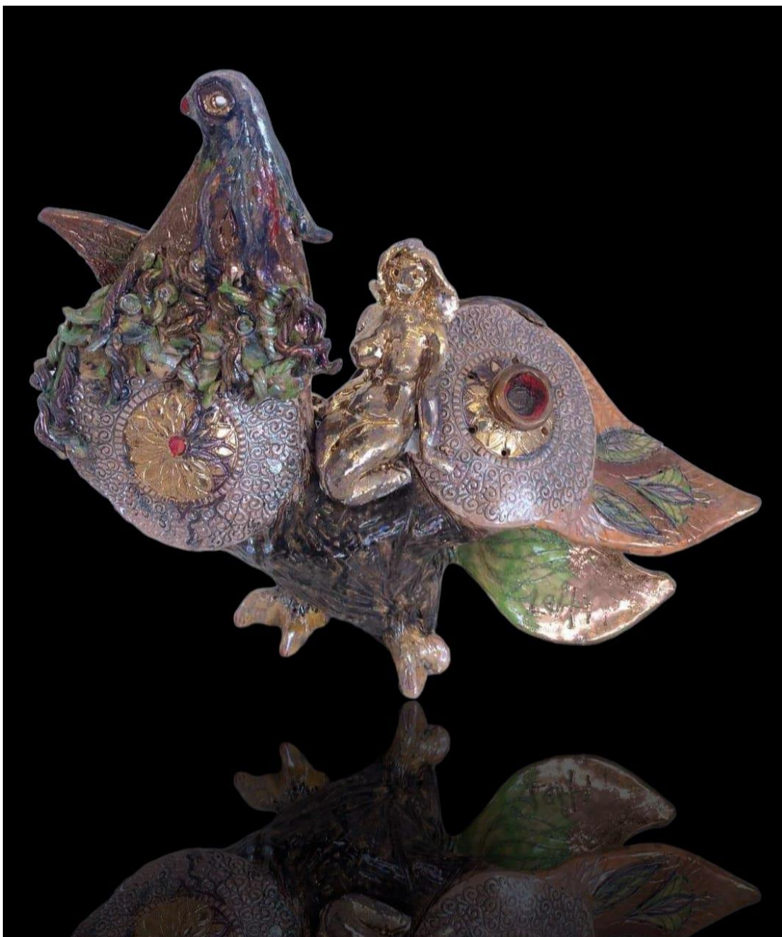
GOLD STATUE 2022 45x45 cm Gold and glaze and engob colors