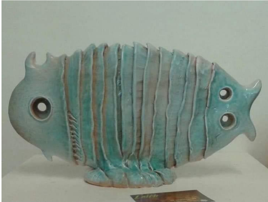
THE SEA, 2018, 40x23 cm, Earthenware