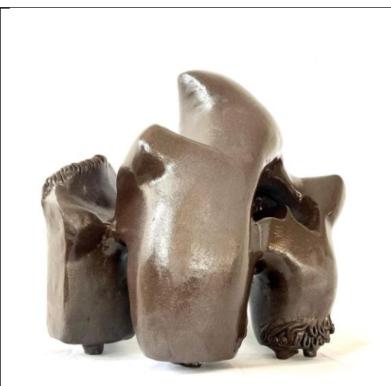
"SWEETNESS", 2022, 45x45 cm, Stoneware / 1240c