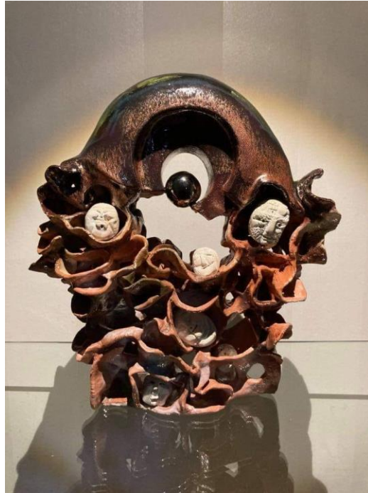
2020 35x40 cm Earthenware