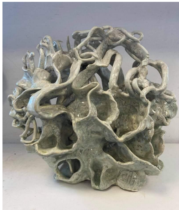
"BEGINNING OF THE DREAM " 2021 40x40. Stone ware. Crystal glaze the