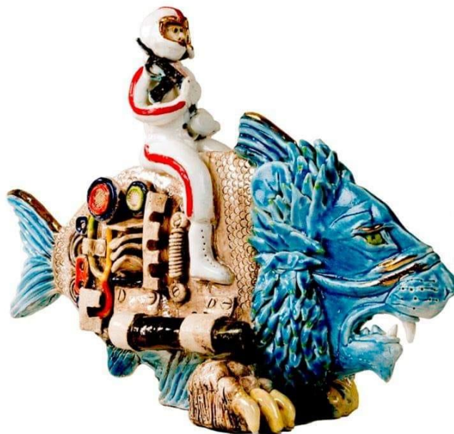
Probably, 2016, 40x40 cm, Earthenware