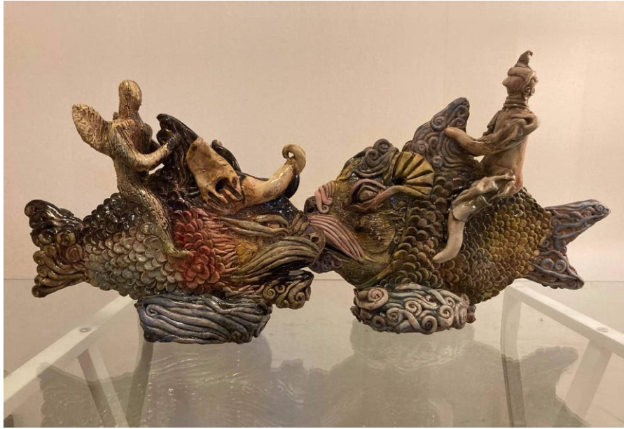
KNIGHTS OF THE LEGEND, 2020, 80x35 cm, Earthenware