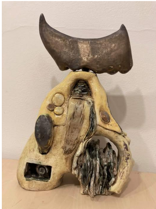
HARMONY, 2020, 30x50 cm, Raku technique