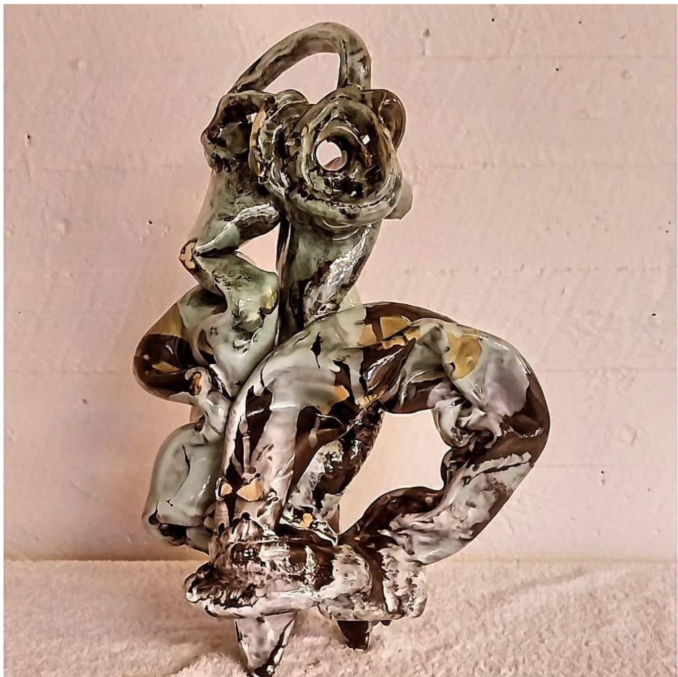
2024 stoneware 1250c. 52×52cm