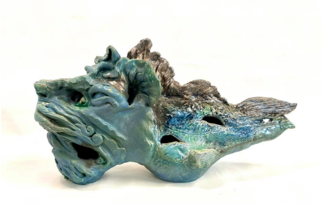
LEGEND LION, Stoneware. 65x35x25 2021.