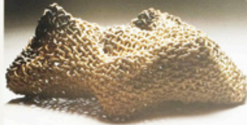
Vortex 75, 8.5 x 22 x 15", clay, 2015

Began in 2009 during my residency at the Museum of Arts and Design, NYC, and continued here at the Hunterdon Art Museum, visitors are invited to carve their names and nationalities into the soft clay arches. For a brief moment in time, mini-communities are formed when strangers interact with each other as they engage in a common goal."