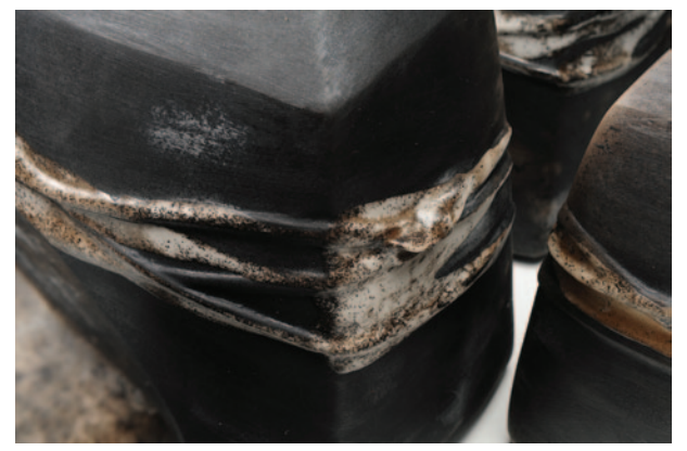
Secret Boxes (Detail).