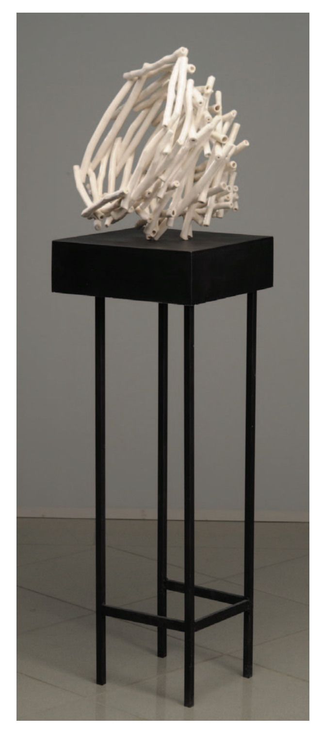
Inside and Outside.

of the inner truth. "These are things that we keep for ourselves against both ourselves and others and they grow as we keep them inside..." The light and colour that exude from the Secret Boxes become meaningful as we face our inner self. The glitter of our expectations and dreams that we feel and experience and